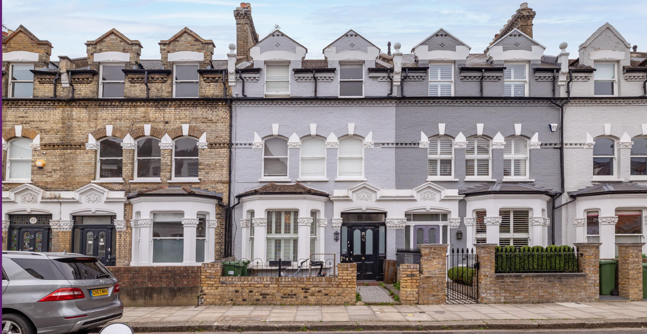
Fulham Park Gardens Parsons Green, SW6