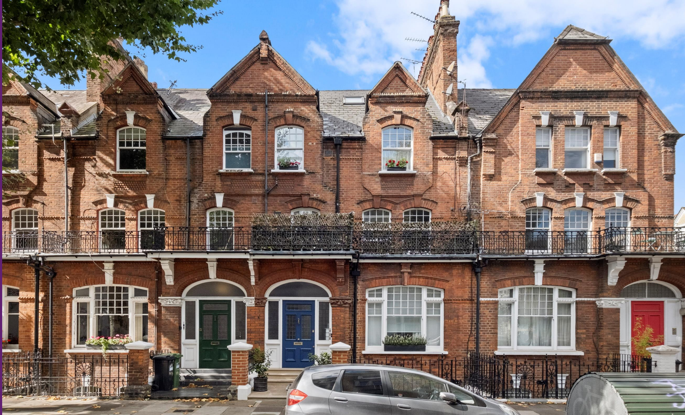
Vereker Road London, W14