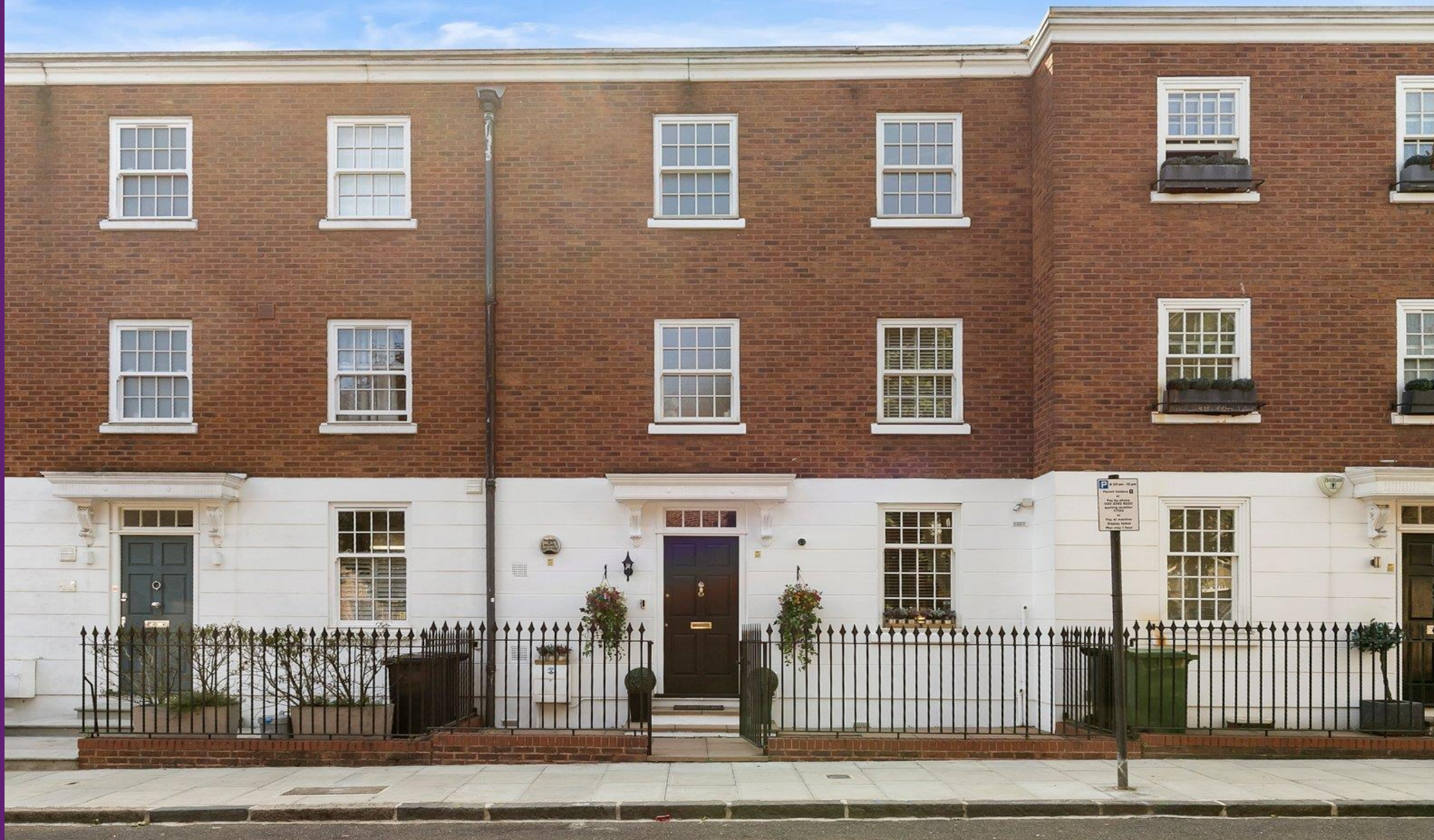
Cambria Street Fulham/Chelsea Border, SW6