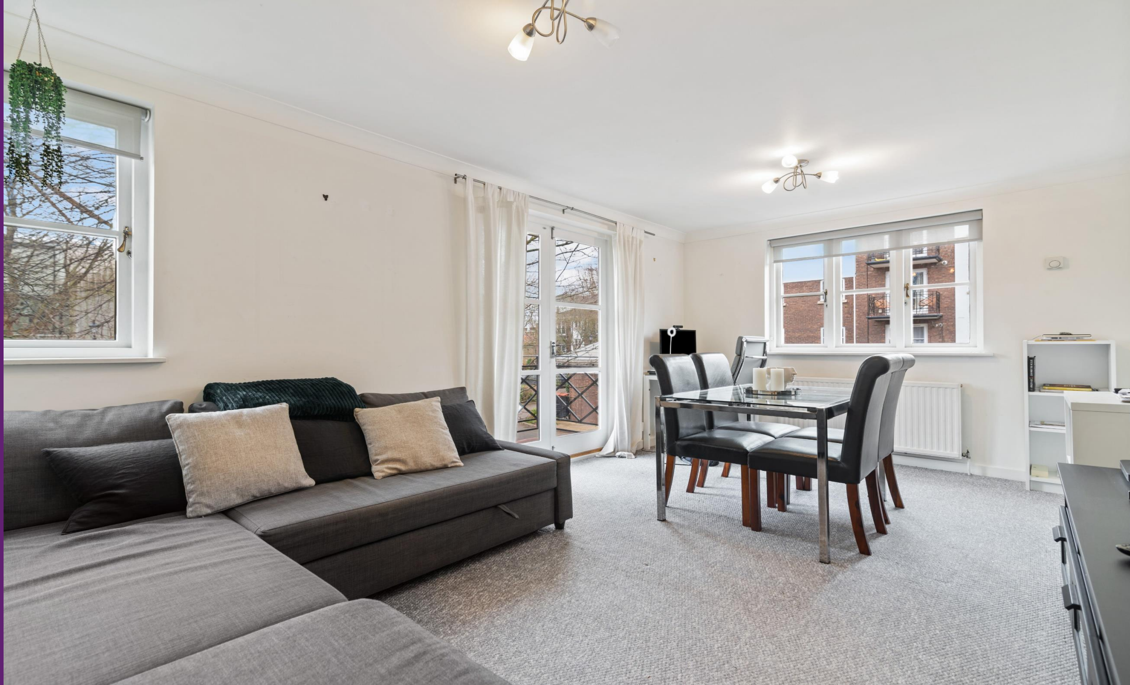
Brompton Park Crescent Fulham, SW6