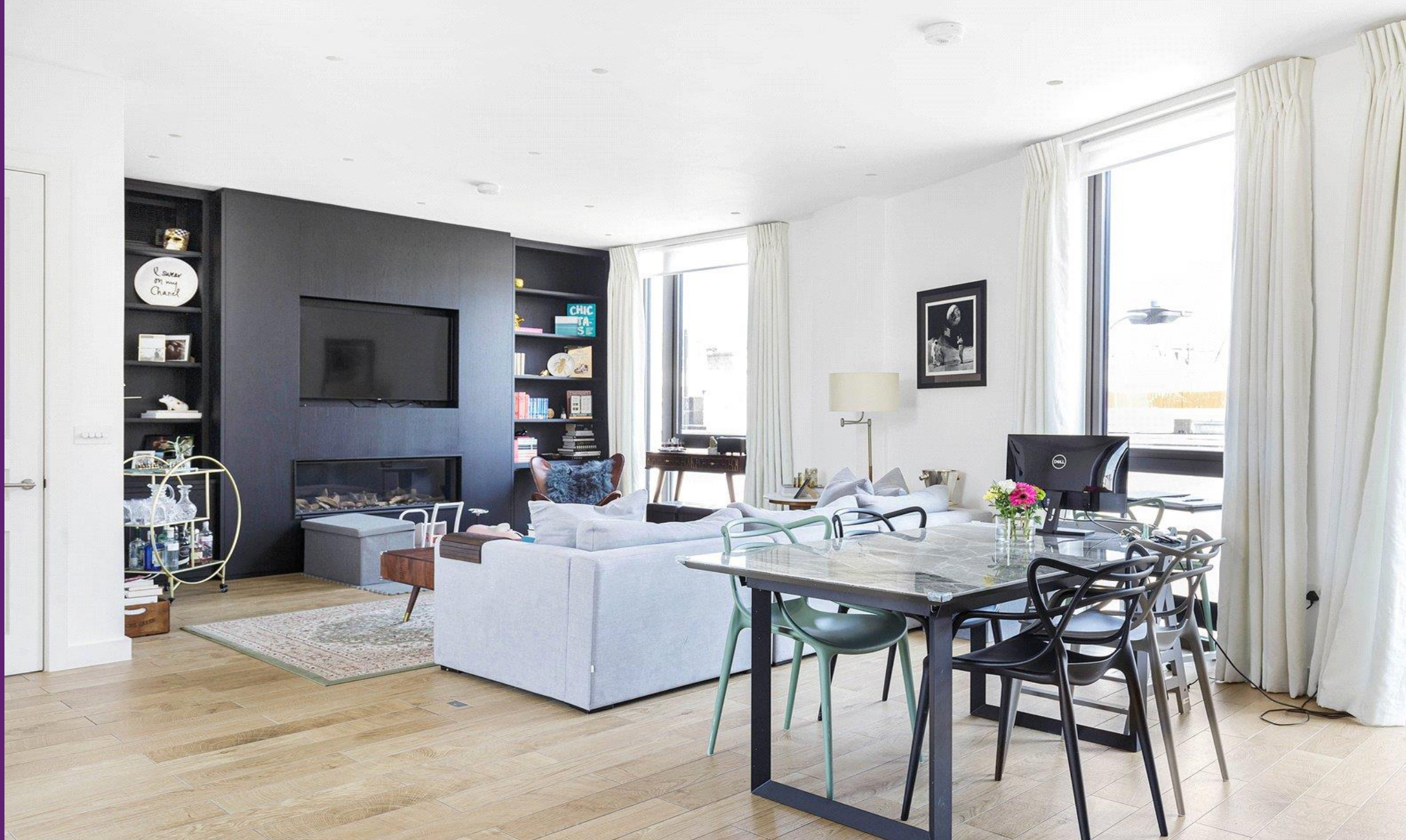
Hand & Flower House 617 Kings Road, SW6