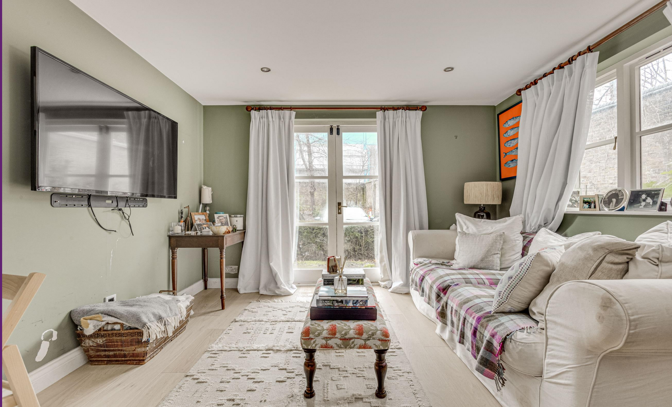
Brompton Park Crescent West Brompton, SW6