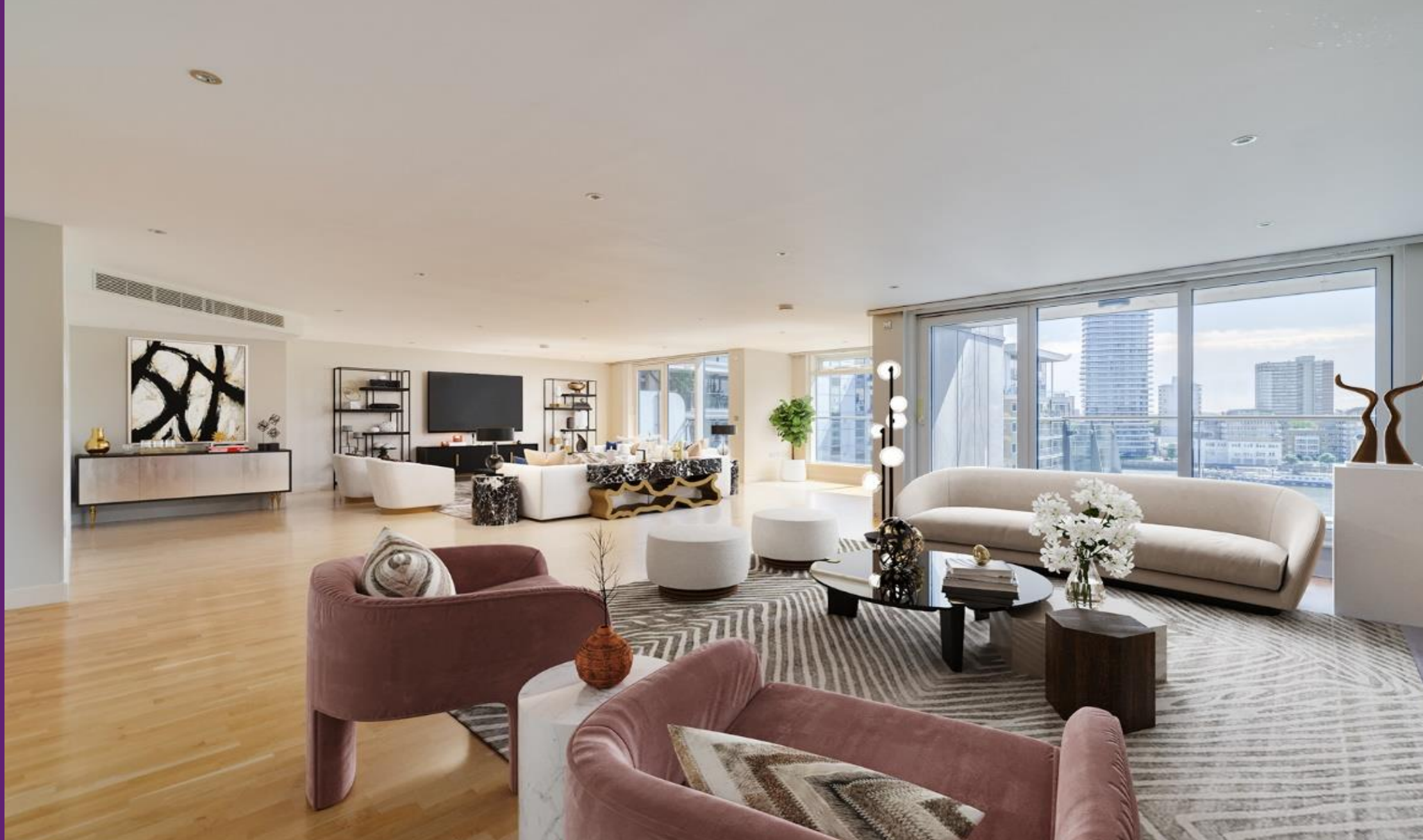
Courtyard House Imperial Wharf, SW6