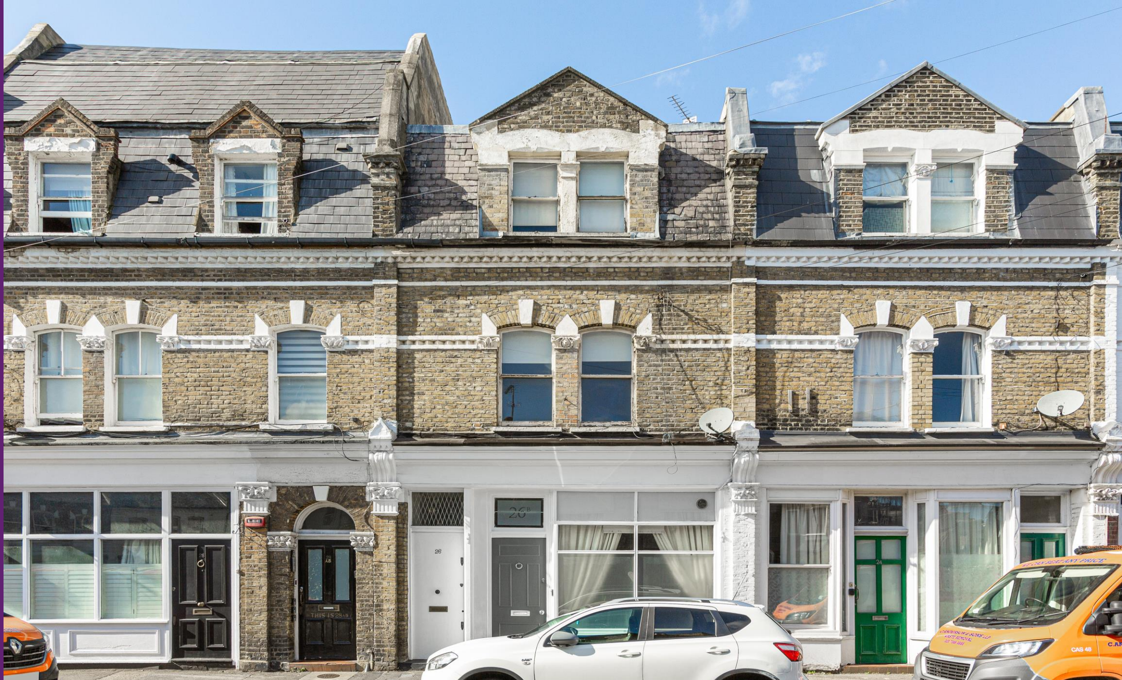
Filmer Road Fulham, SW6