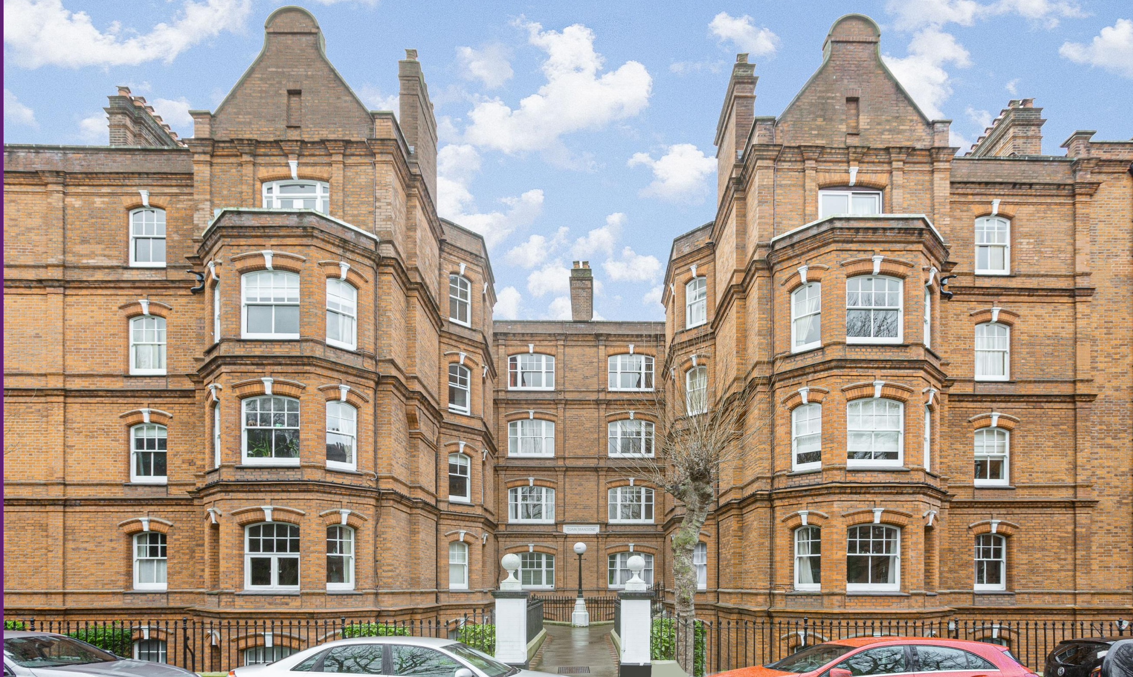
Quain Mansions Queen's Club Gardens, W14