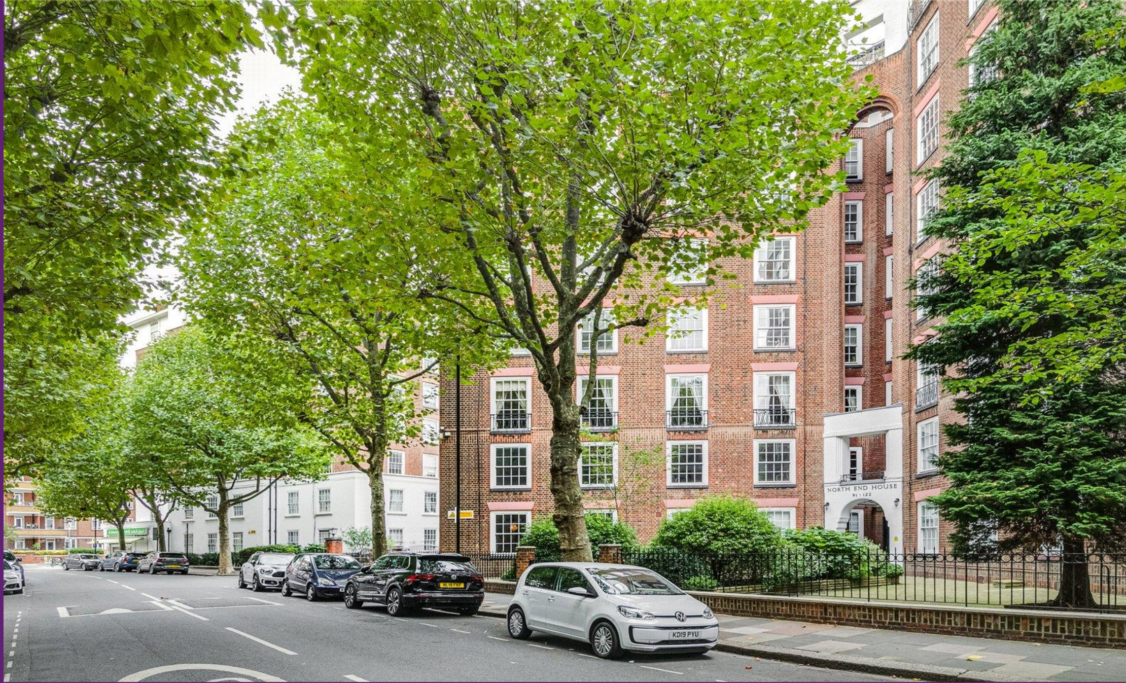
North End House Fitzjames Avenue, W14