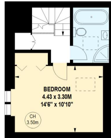
294 sq ft First Floor

This floor plan is a representation for guidance purposes only, not for valuation. Any figure is approximate and must not be relied on as a statement of fact. Copyright of Wyatt Dixon Homes