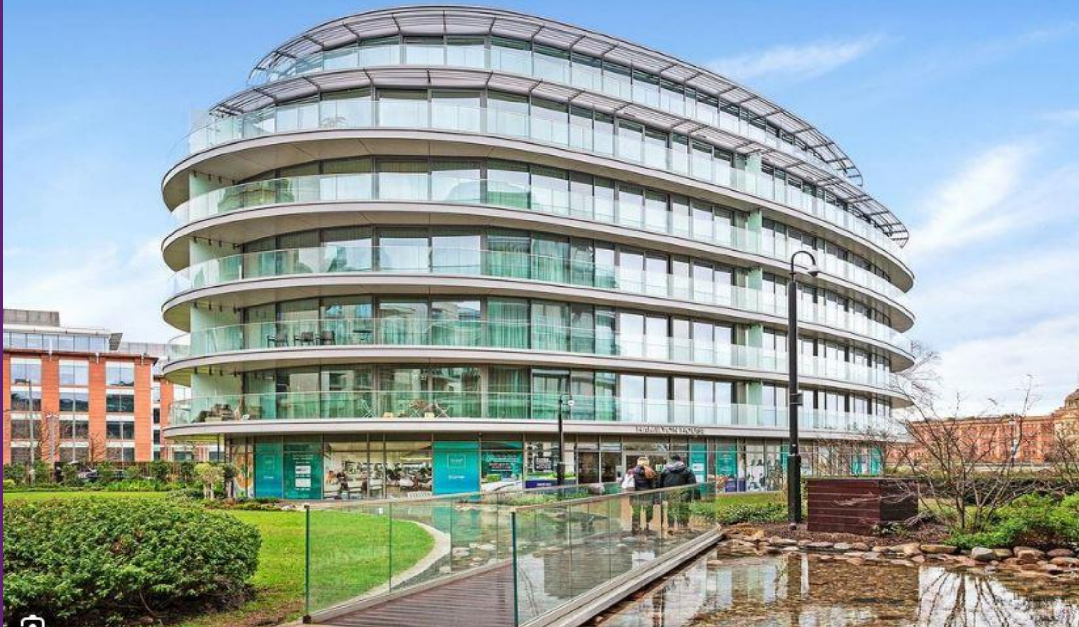
Hamilton House Fulham Reach, W6