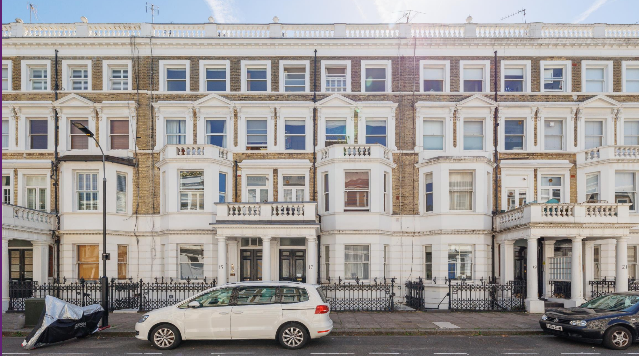
Comeragh Road West Kensington, W14