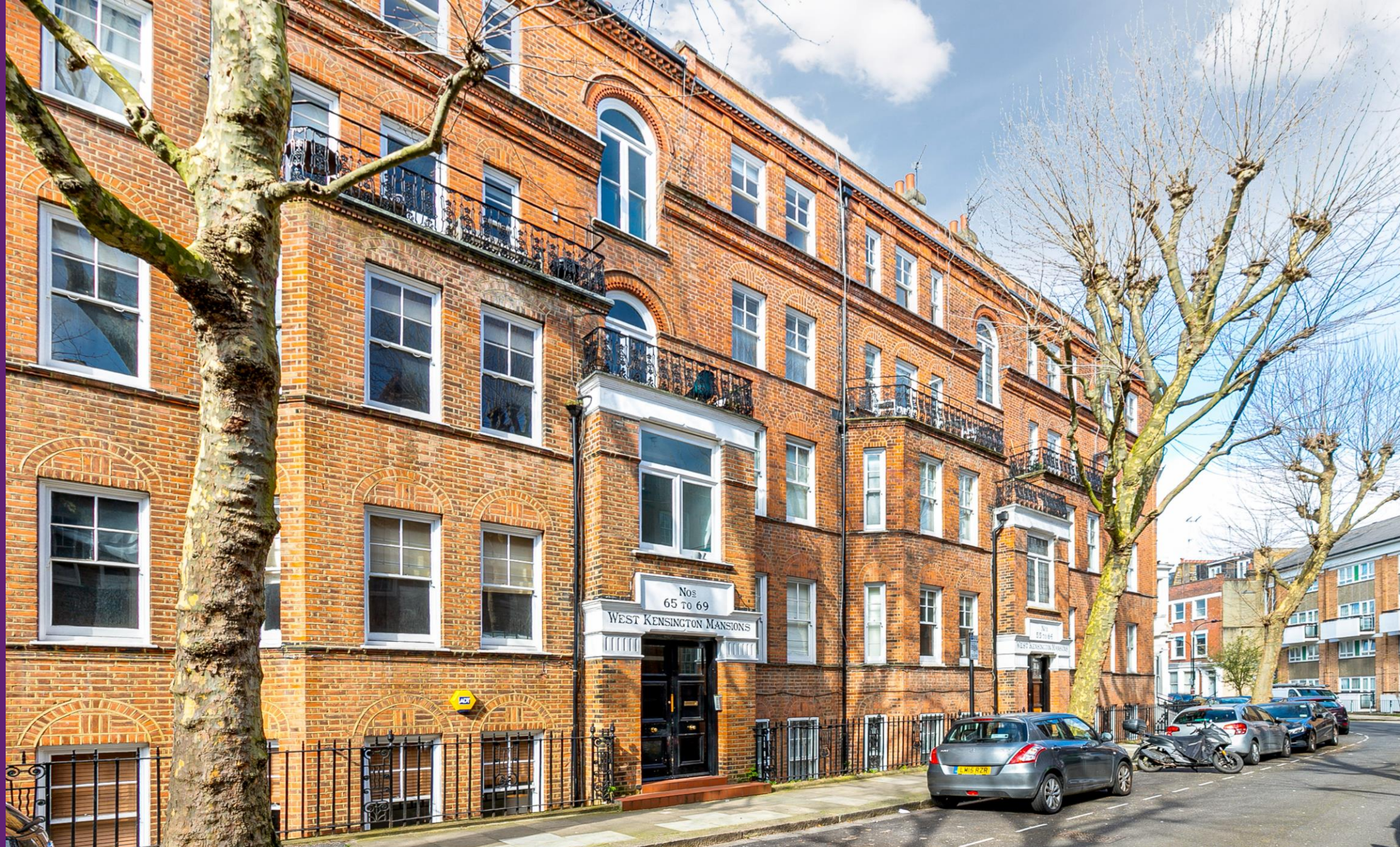
West Kensington Mansions Beaumont Crescent, W14