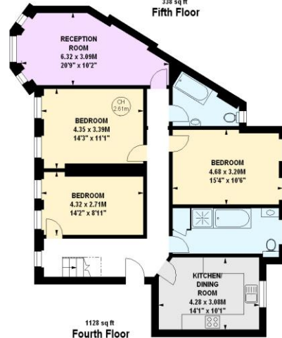
1128 sq ft Fourth Floor

The floor plan is not to scale and measurements and areas shown are approximate and therefore should be used for illustrative purposes only. The plan has been prepared in accordance with the RICS code of Measuring Practice and whilst we have confidence in the information produced, it must not be relied on. If there is any aspect of particular importance, you should carry out or commission your own inspection of the property. Copyright of FeaturePRO.