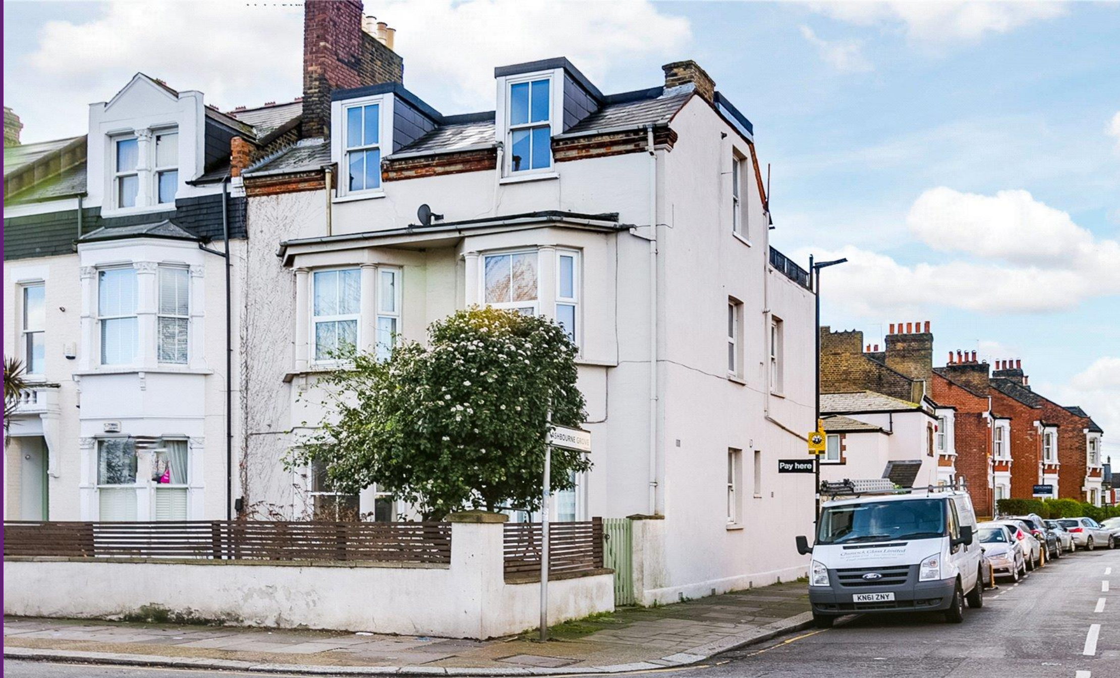
Chiswick Lane London, W4