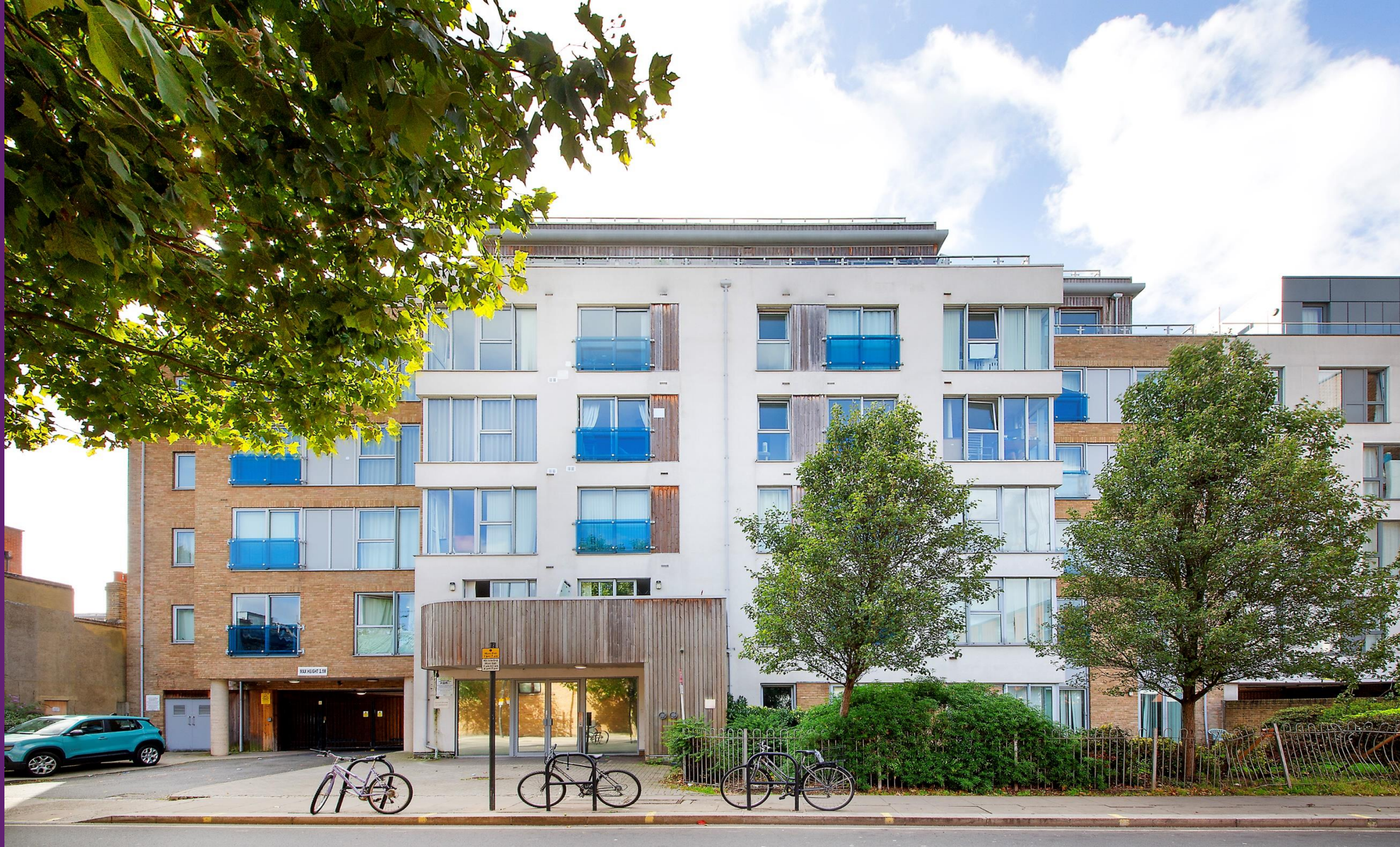
Gooch House 63-75 Glenthorne Road, W6