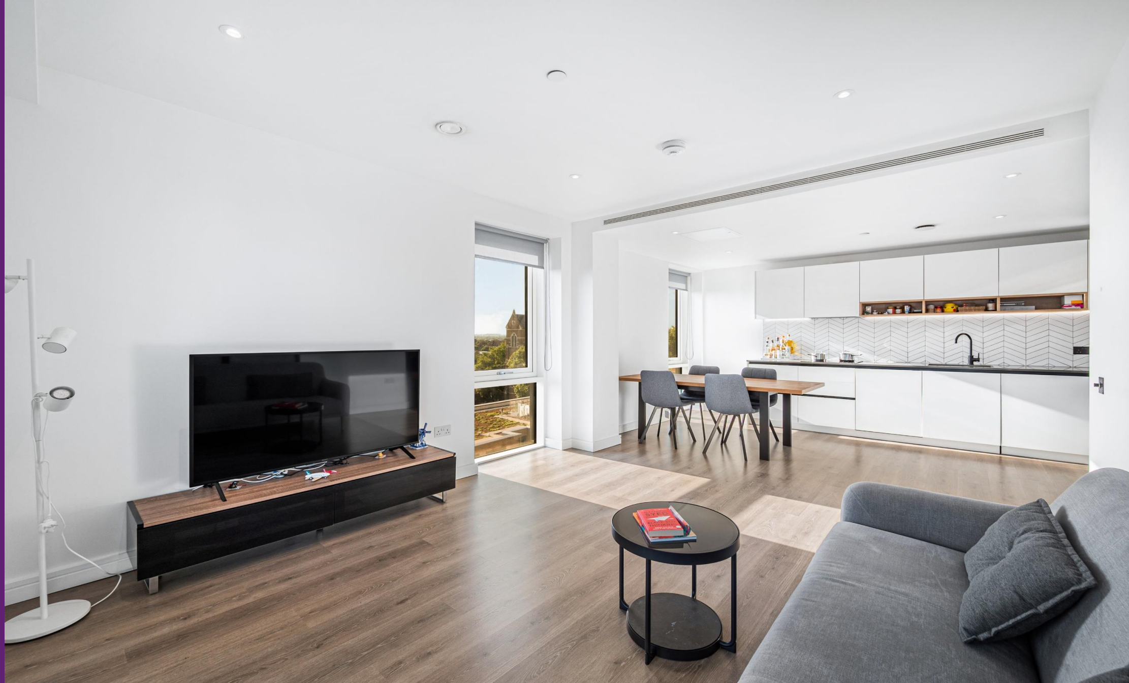
Matcham House 21 Glenthorne Road, W6