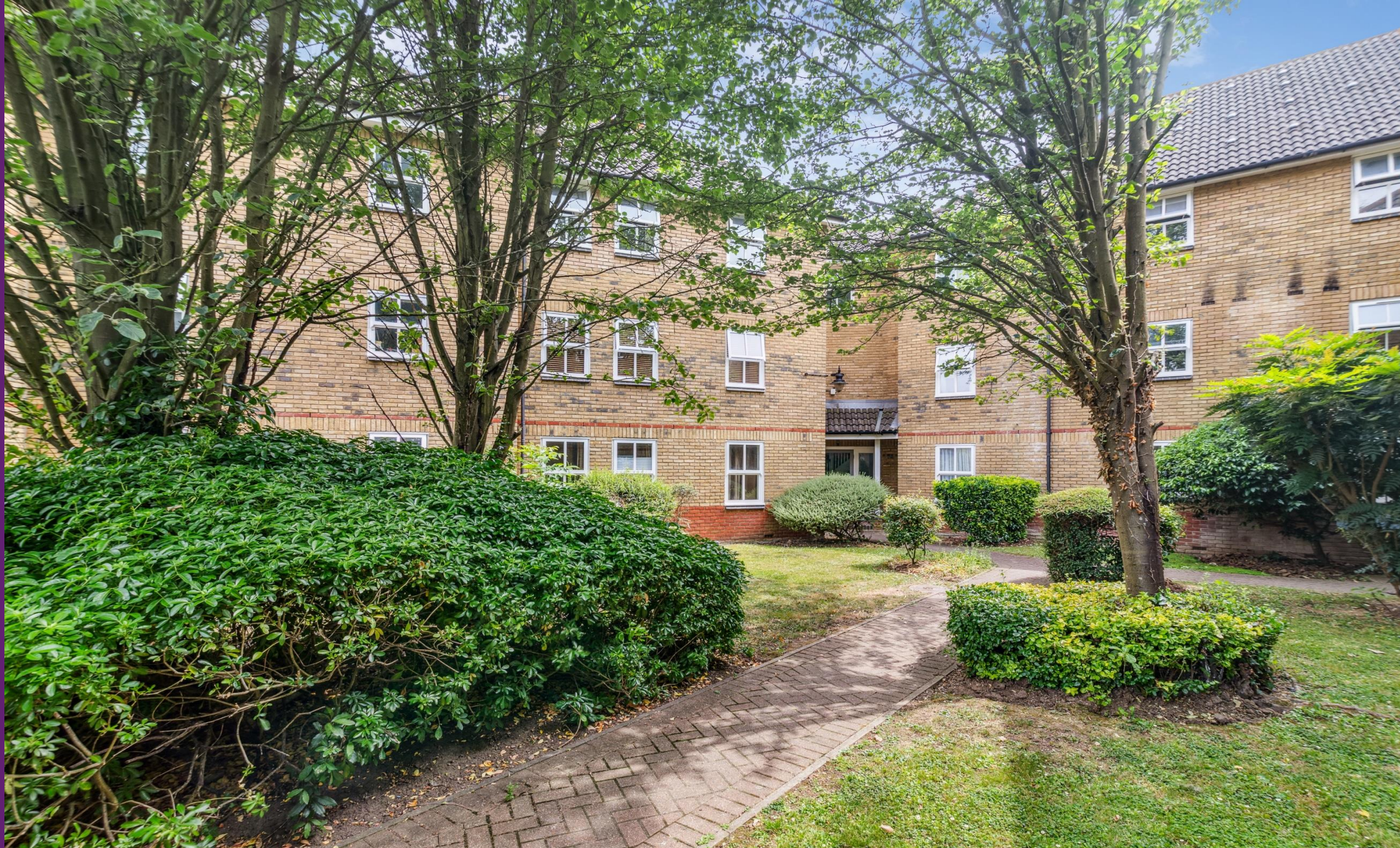
Alfred Close London, W4