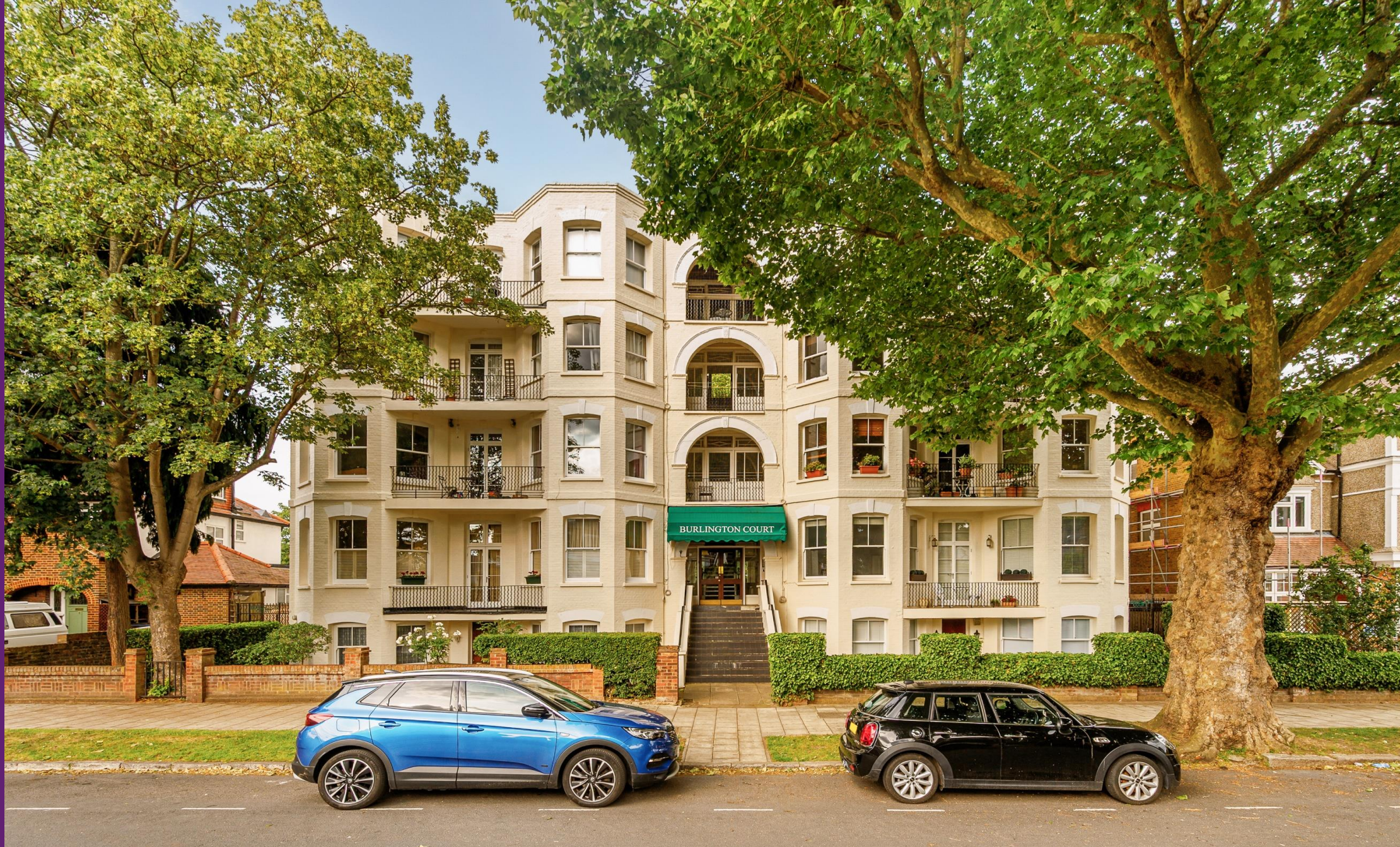
Burlington Court Spencer Road, W4