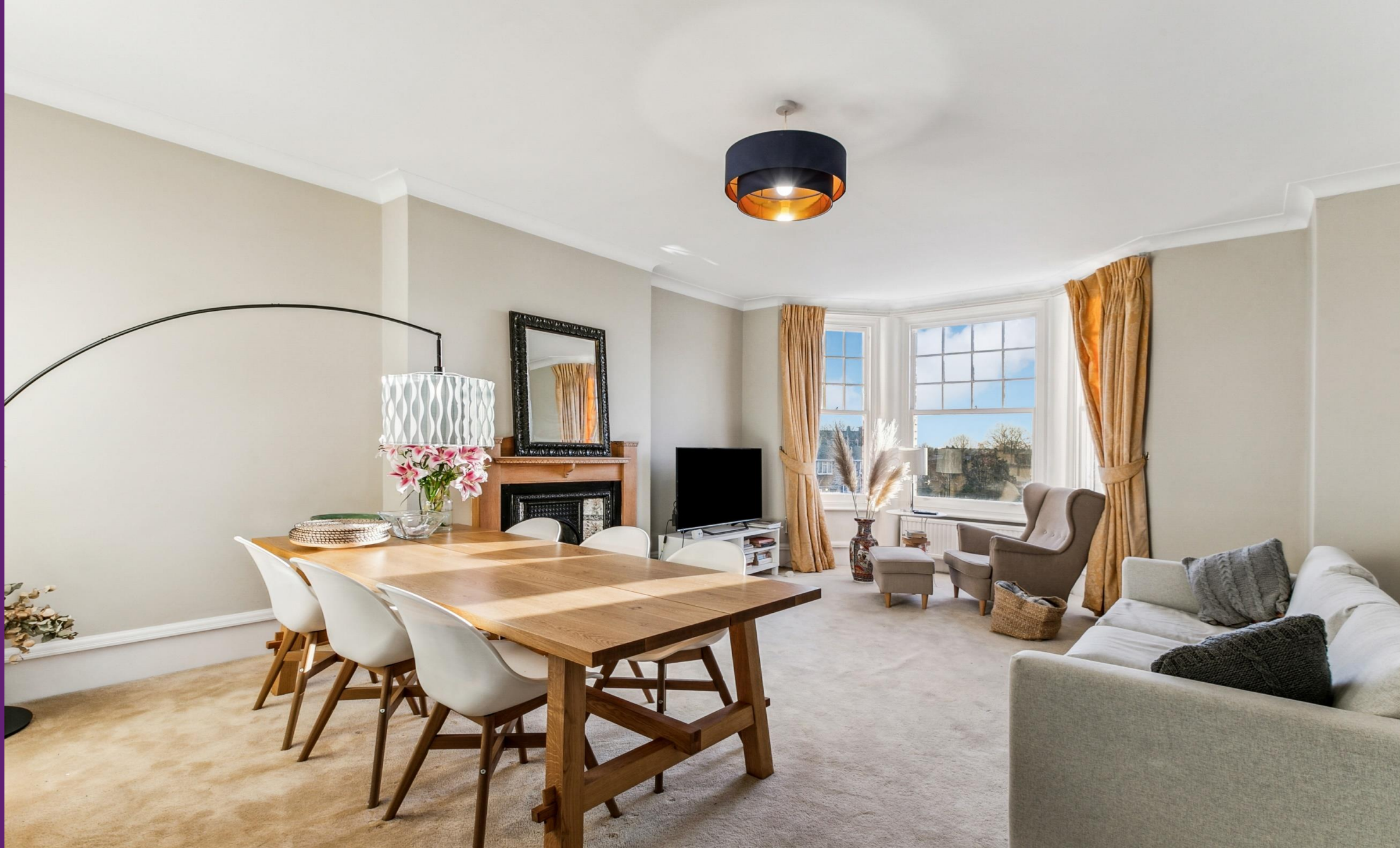
Sutton Court Fauconberg Road, W4