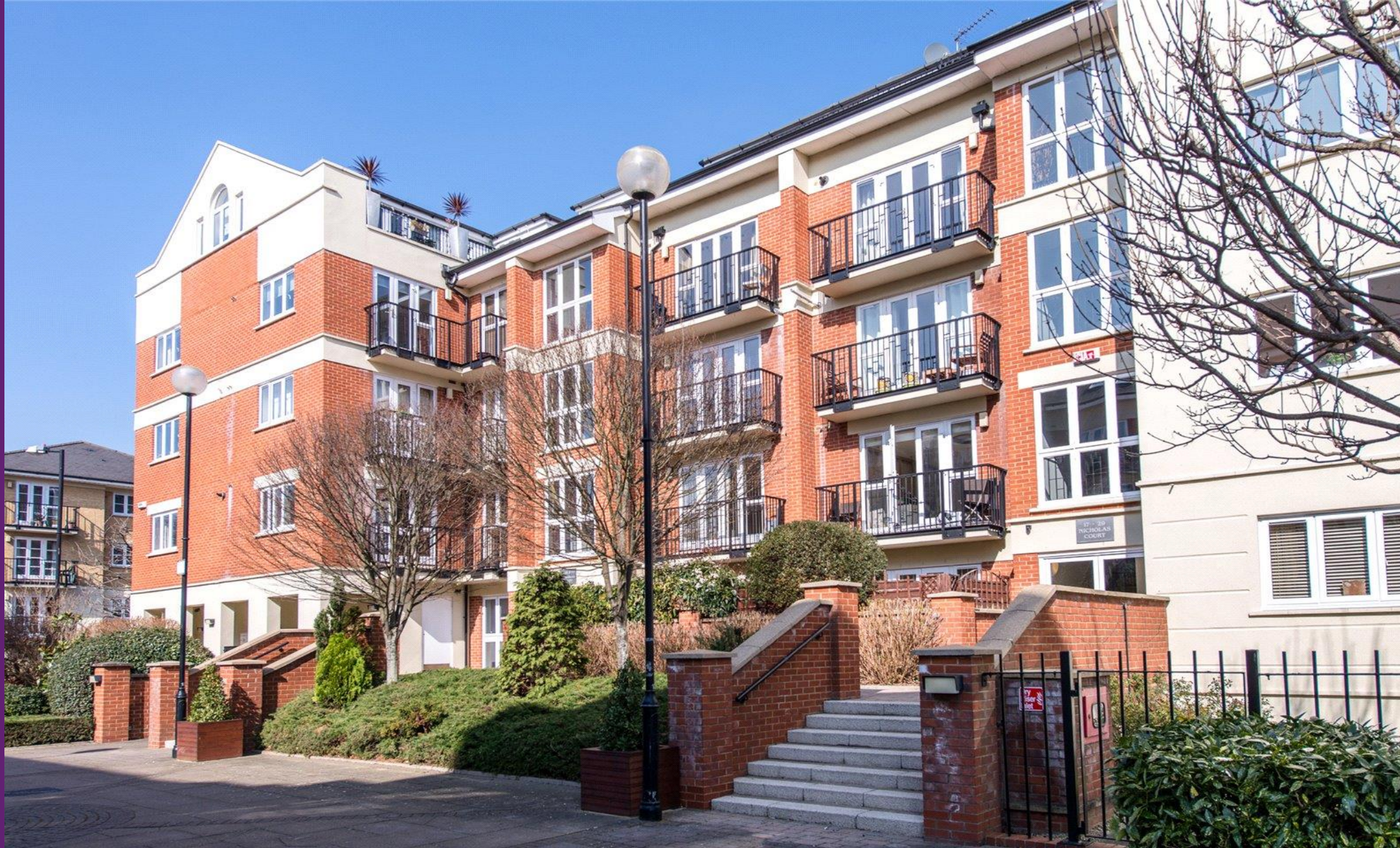
Nicholas Court Corney Reach Way, W4