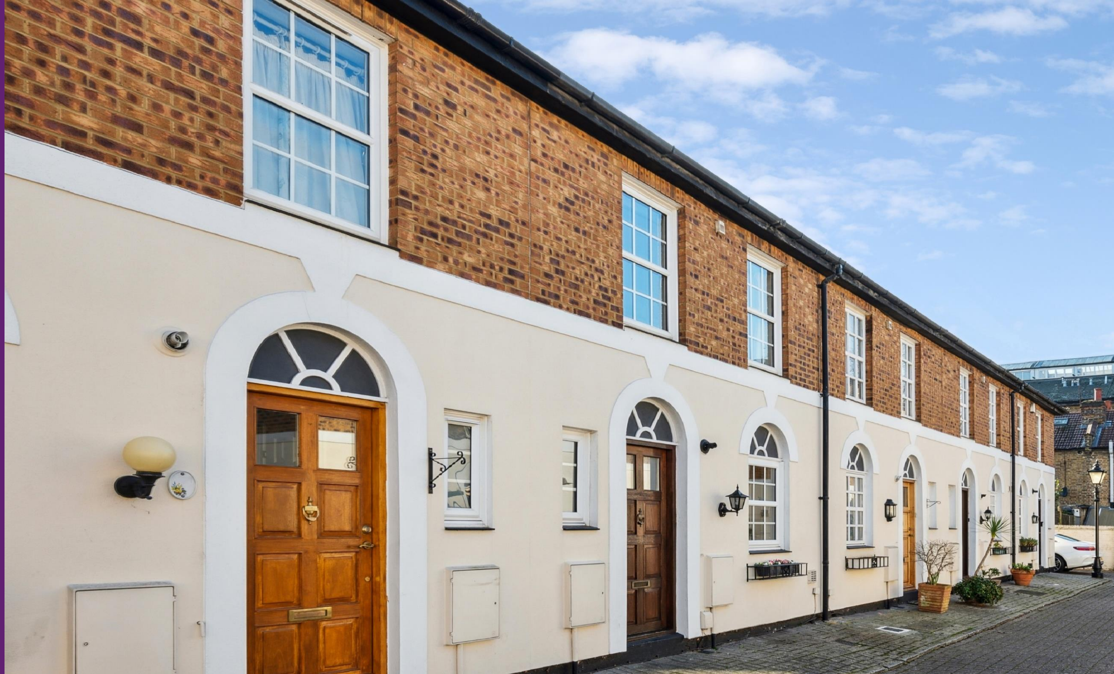
Copenhagen Gardens London, W4