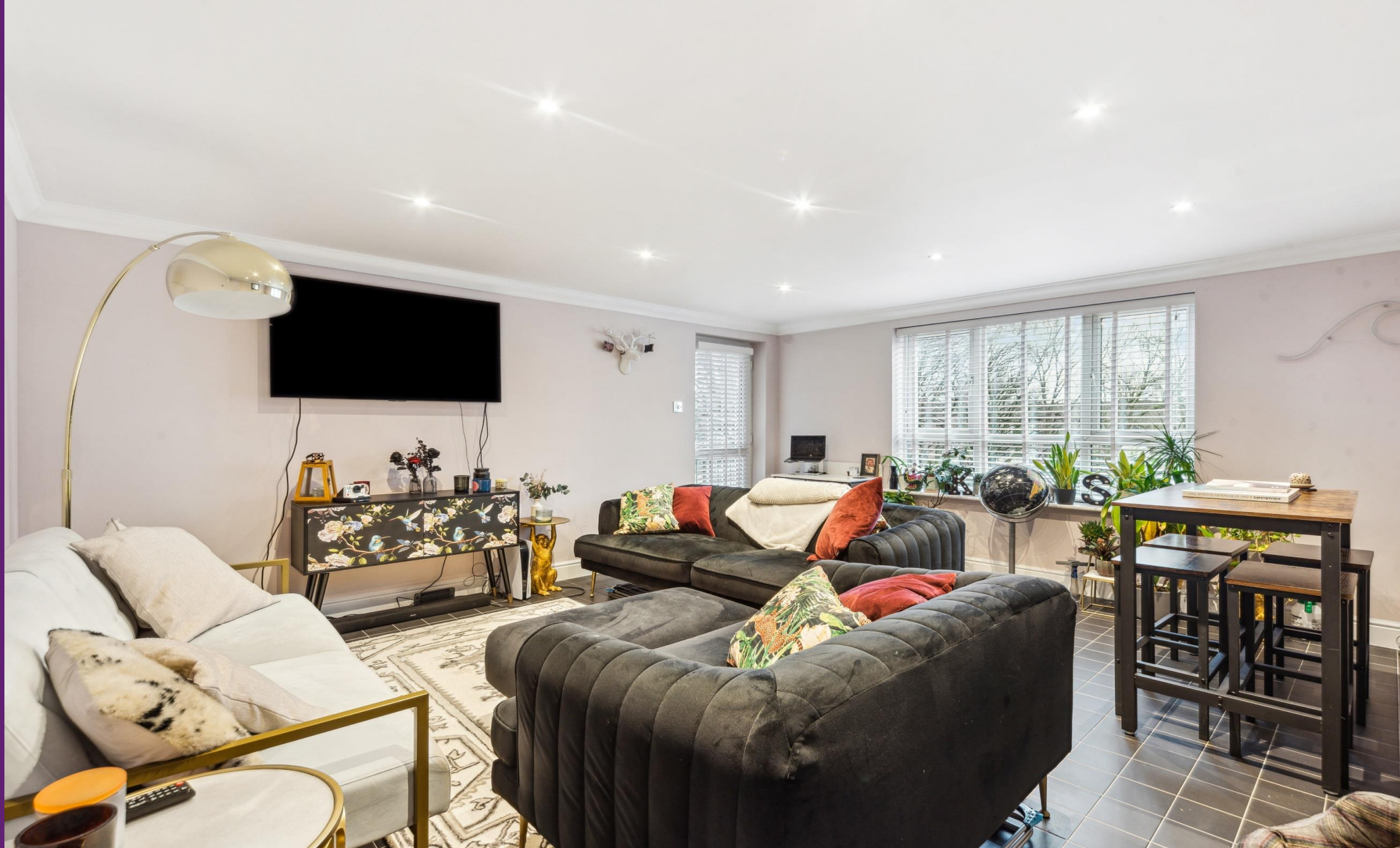
Greenview Close London, W3