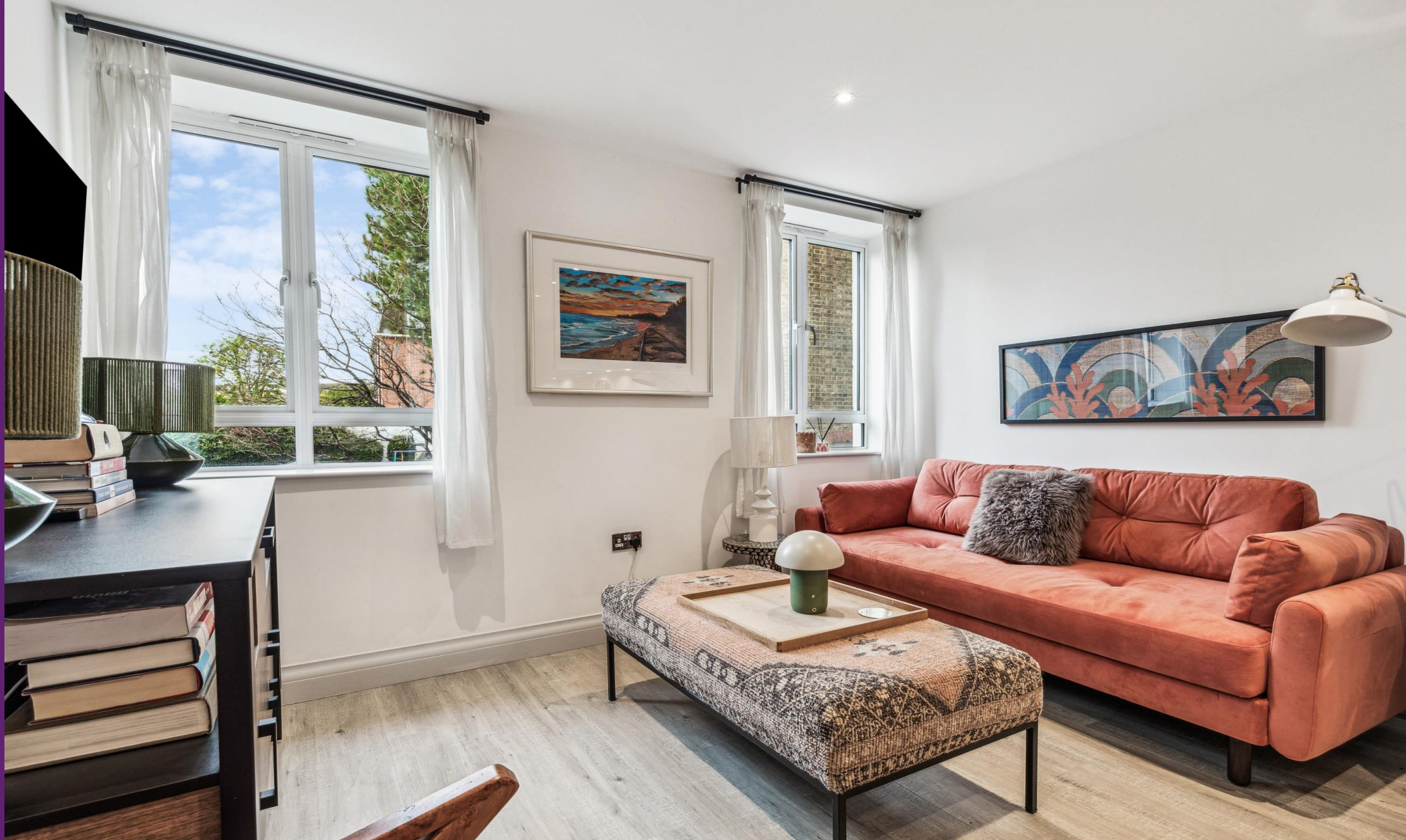
Devonhurst Place Heathfield Terrace, W4