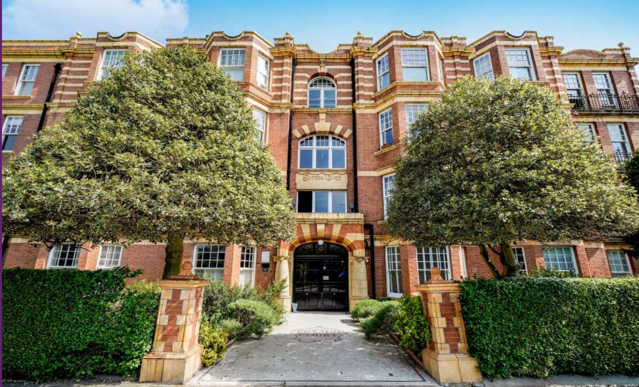
Sutton Court Fauconberg Road, W4