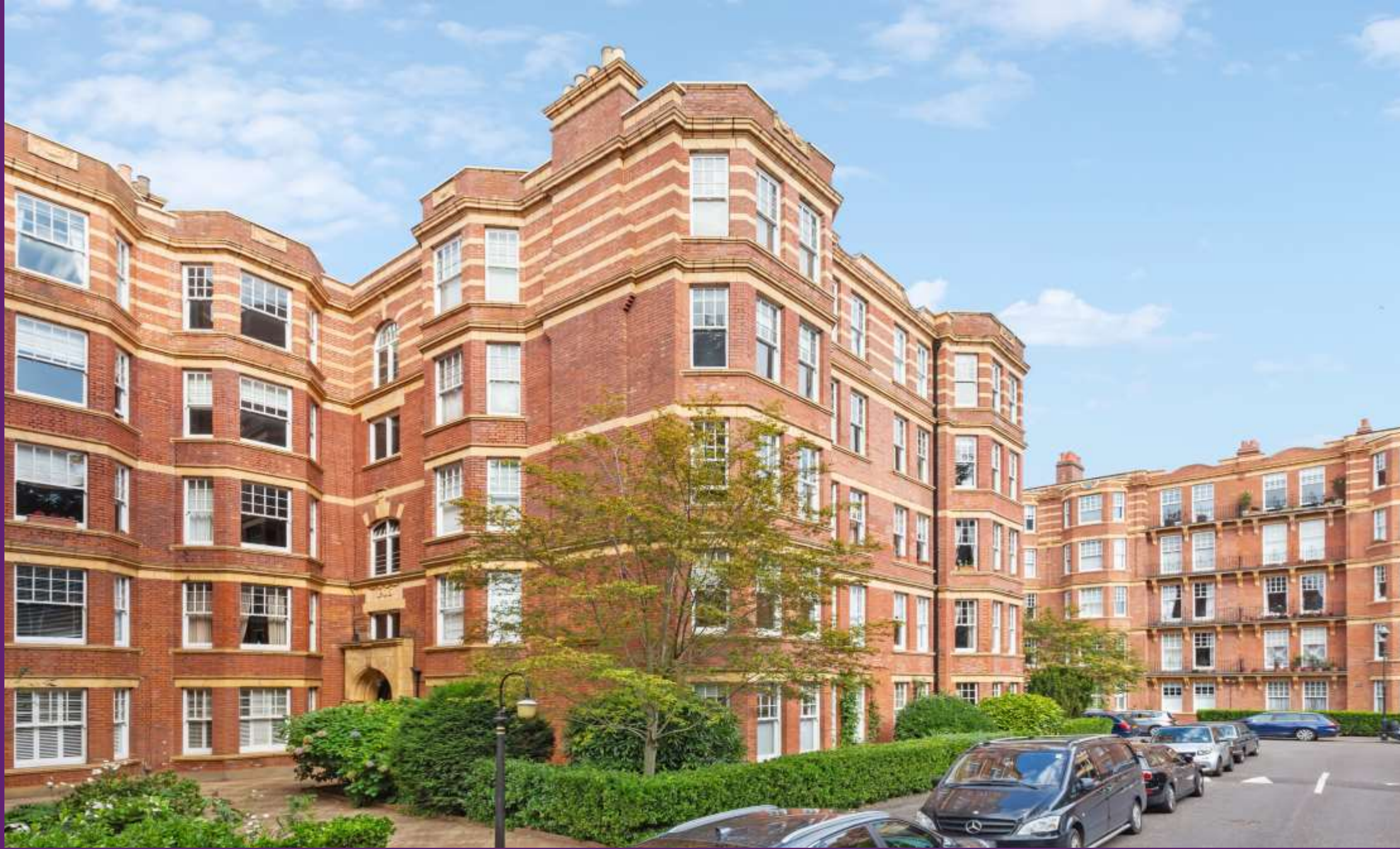
Sutton Court Chiswick, W4