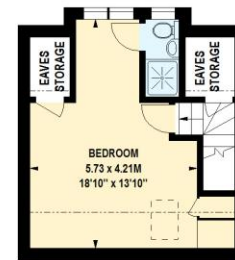
261 sq ft Second Floor

This floor plan is a representation for guidance purposes only, not for valuation. Any figure is approximate and must not be relied on as a statement of fact.