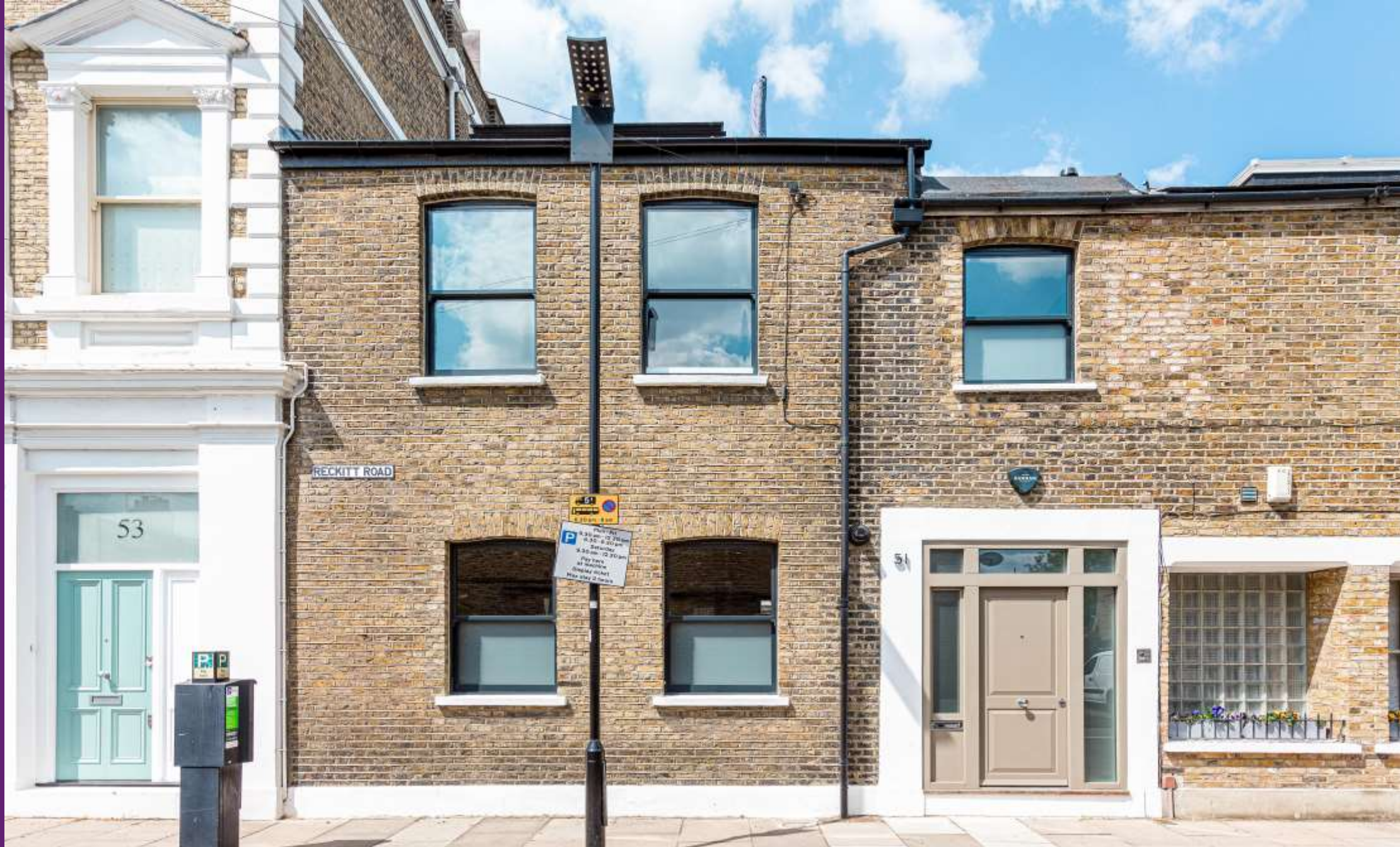
Reckitt Road London, W4