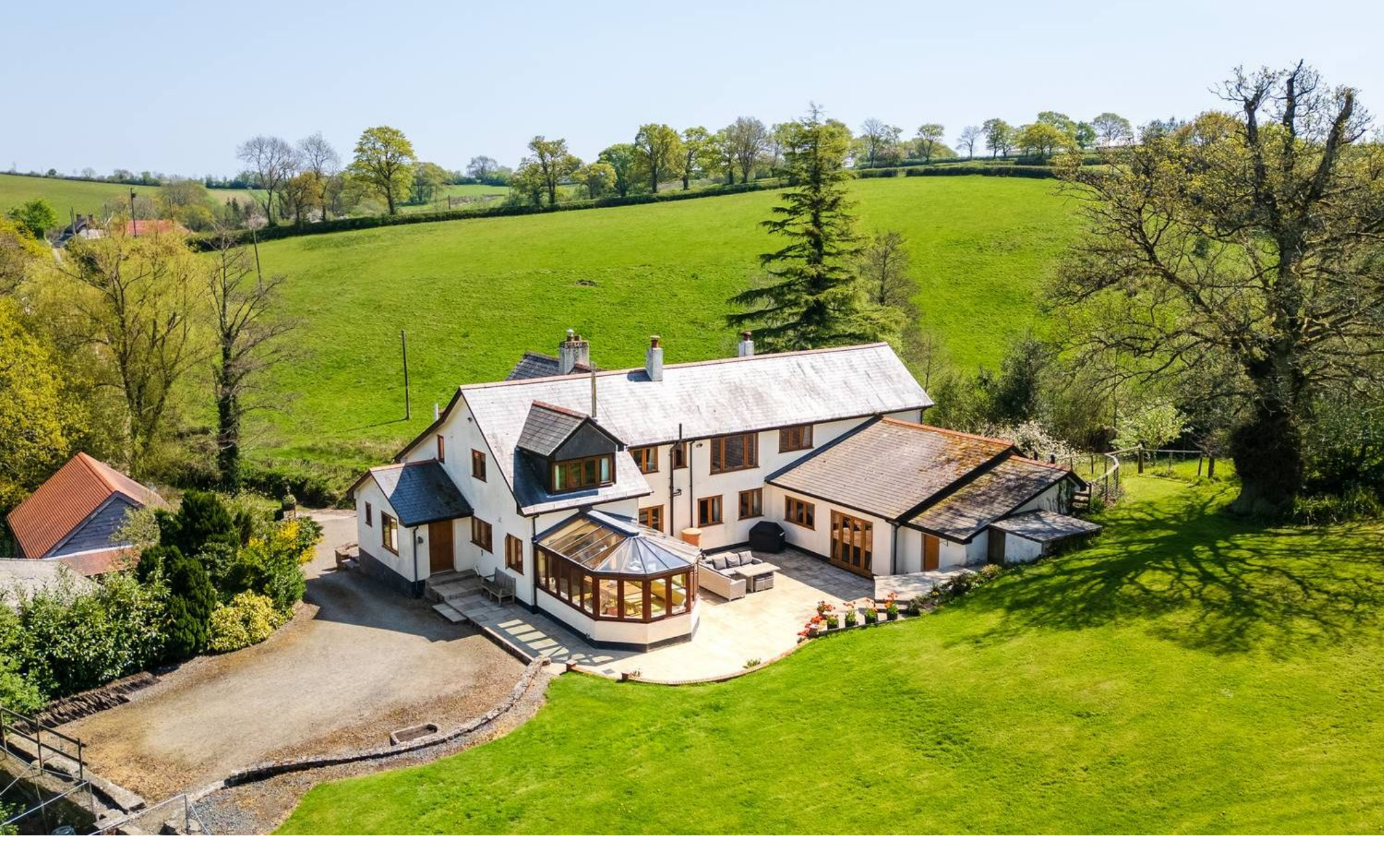
Crayford, Hittisleigh, EX6 6LE Guide Price £1,350,000