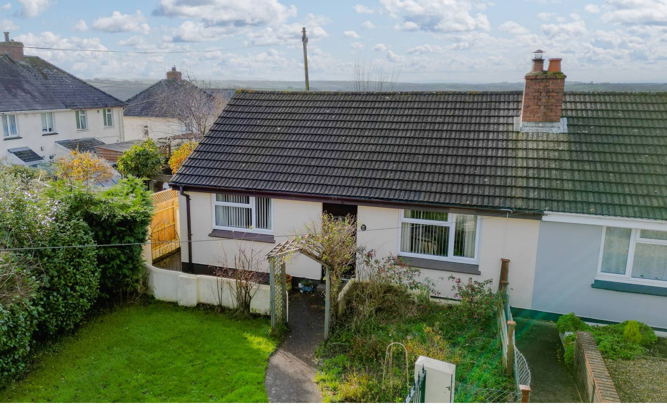
11 Westgate, Lapford, EX17 6QQ