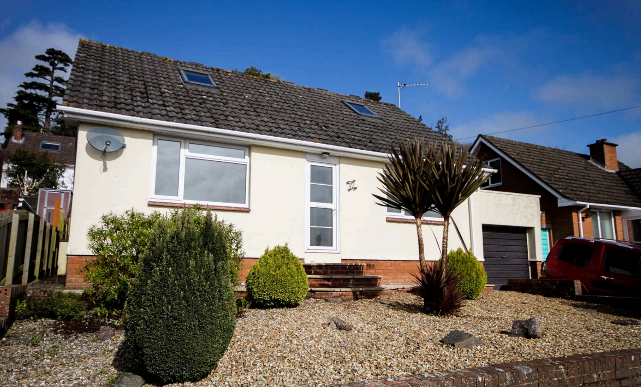
32 Blagdon Rise, Crediton £1,300 pcm