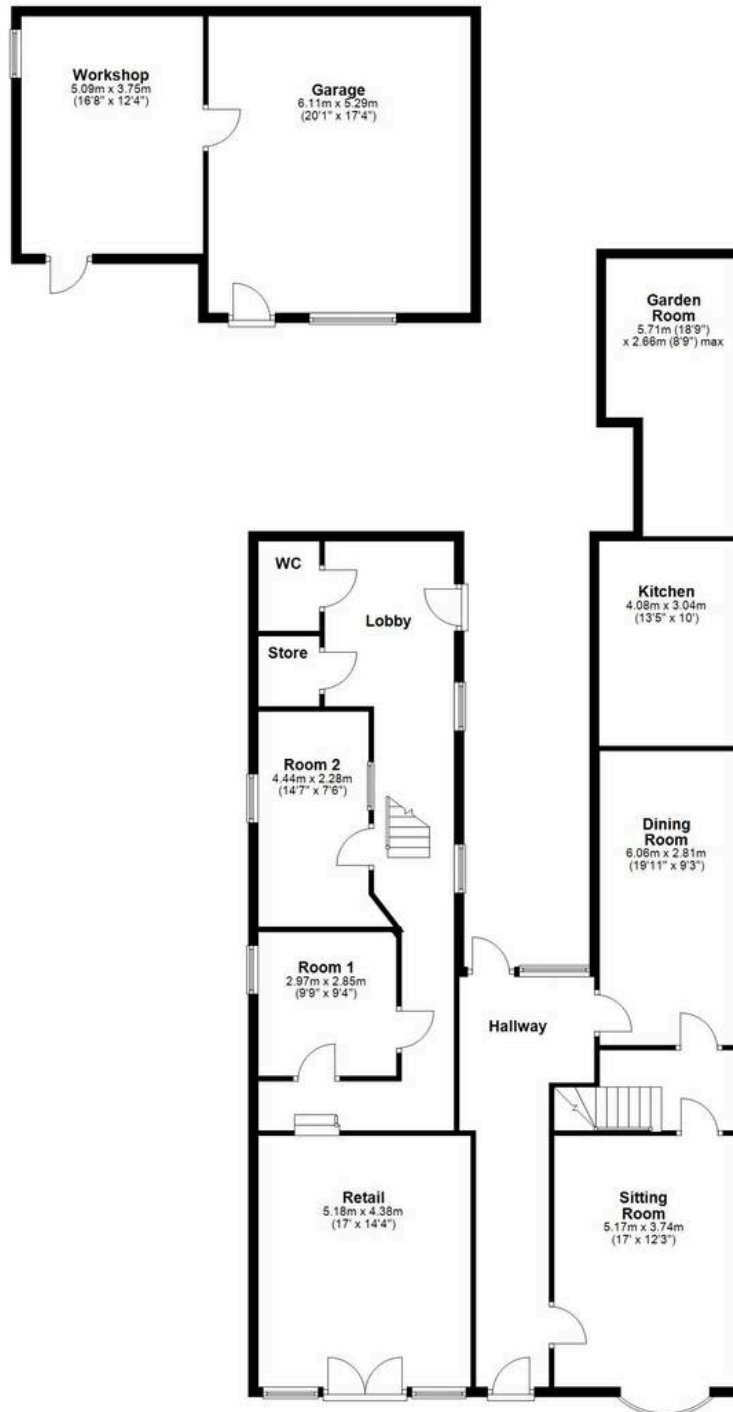
Ground Floor Approx. 210.6 sq. metres (2267.3 sq. feet)