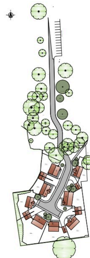
PROPOSED OVERALL SITE PLAN