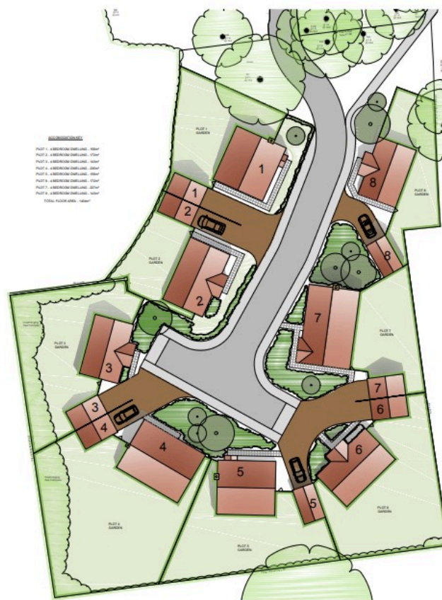
PROPOSED SITE PLAN - LAYOUT SHOWN INDICATIVELY FOR OUTLINE PURPOSES