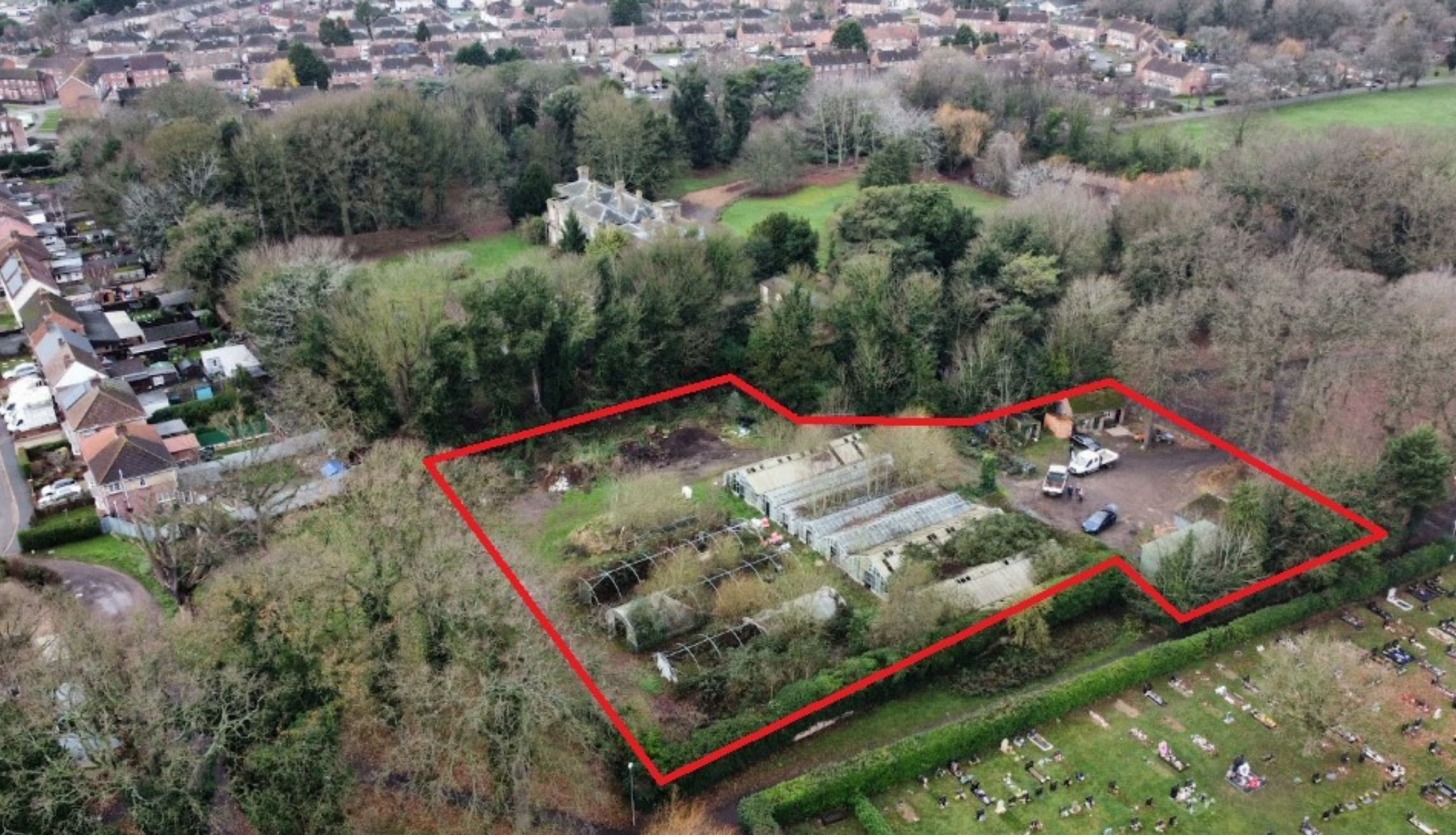
Gaywood Hall Nursery Site, Gayton Road, King's Lynn PE30 4EE