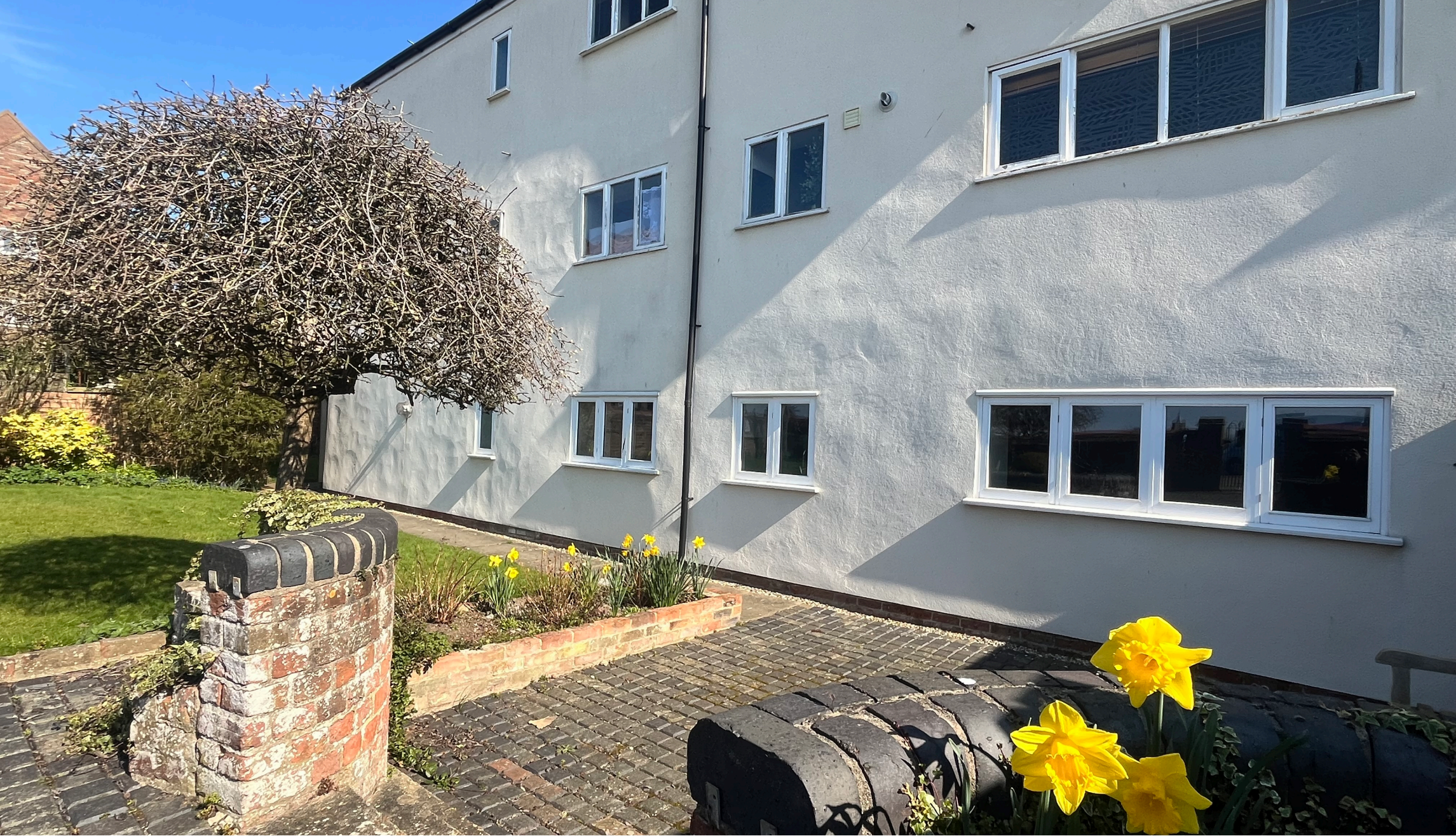
Riverside Court, South Quay, King's Lynn PE30 5DB