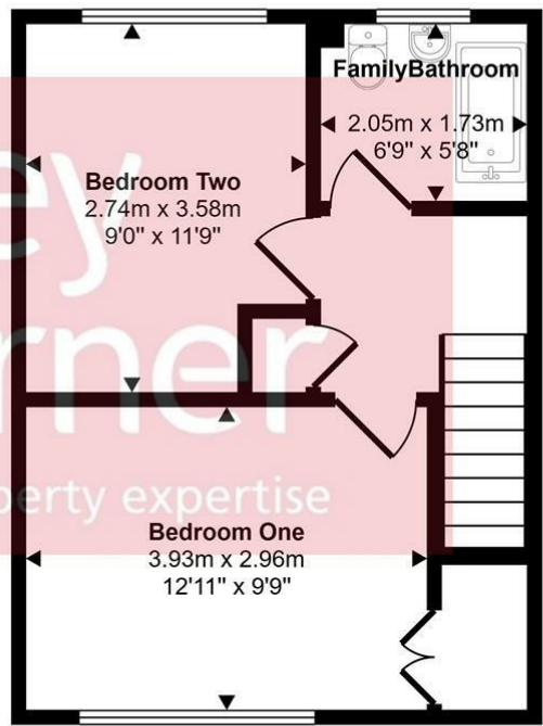
First Floor Approx 33 sq m / 355 sq ft

This floorplan is only for illustrative purposes and is not to scale. Measurements of rooms, doors, windows, and any items are approximate and no responsibility is taken for any error, omission or mis-statement. Icons of items such as bathroom suites are representations only and may not look like the real items. Made with Made Snappy 360.