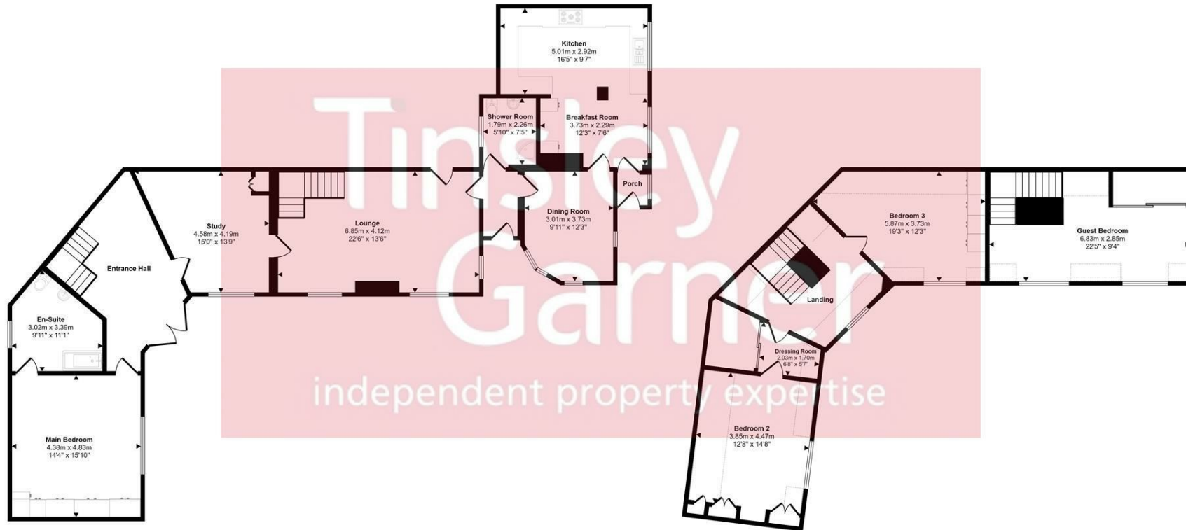
Ground Floor Approx 136 sq m / 1465 sq ft

Approx Gross Internal Area 221 sq m / 2383 sq ft