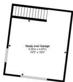
Garage First Floor Approx 30 sq m / 319 sq ft