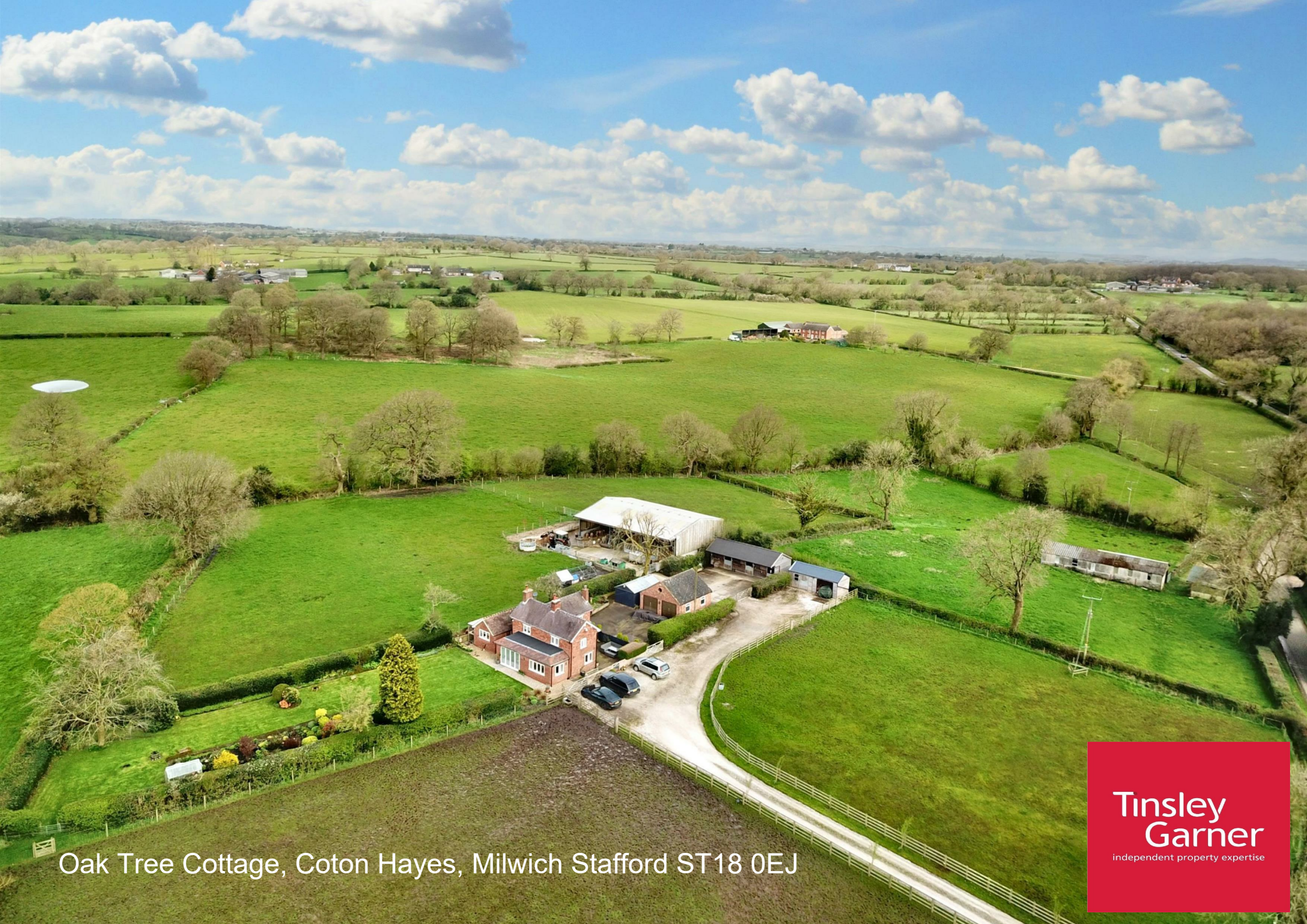
Oak Tree Cottage, Coton Hayes, Milwich Stafford ST18 0EJ

Tinsley Garner independent property expertise