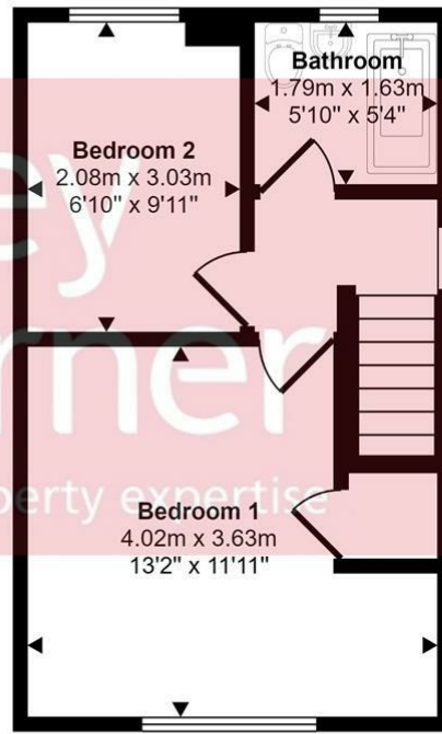
First Floor Approx 27 sq m / 295 sq ft

This floorplan is only for illustrative purposes and is not to scale. Measurements of rooms, doors, windows, and any items are approximate and no responsibility is taken for any error, omission or mis-statement. Icons of items such as bathroom suites are representations only and may not look like the real items. Made with Made Snappy 360.