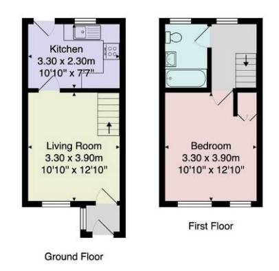
Total Area: 43.3 m² ... 466 ft² All measurements are approximate and for display purposes only. No liability is accepted by either the agency or Box Property Solutions Ltd as to the exact measurements of the rooms. Box Property Solutions Ltd retains the copyright on this plan and allows agents to use it with agreed permission.