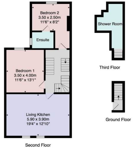
Total Area: 72.0 m² ... 775 ft² All measurements are approximate and for display purposes only. No liability is accepted by either the agency or 80x Property Solutions Ltd as to the exact measurements of the rooms. Box Property Solutions Ltd retains the copyright on this plan and allows agents to use it with agreed permission.