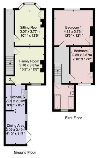
Total Area: 84.6 m² ... 911 ft² All measurements are approximate and for display purposes only. No liability is accepted by either the agency or Box Property Solitons Ltd as to the exact measurements of the rooms. Box Property Solutions Ltd retains the copyright on this plan and allows agents to use it with agreed permission. Copyright 2017 Ac2