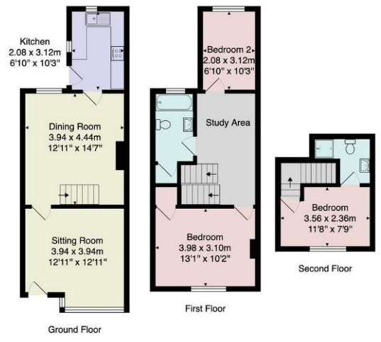
Total Area: 90.9 m² ... 979 ft² All measurements are approximate and for display purposes only. No liability is accepted by either the agency or Box Property Solutions Ltd as to the exact measurements of the rooms. Box Property Solutions Ltd retains the copyright on this plan and allows agents to use it with agreed permission.