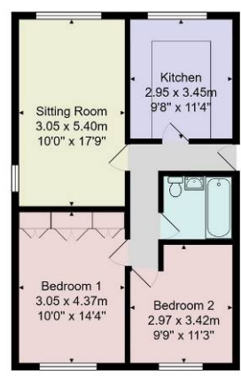
Total Area: 61.2 m² ... 659 ft² All measurements are approximate and for display purposes only. No liability is accepted by either the agency or Box Property Solutions Ltd as to the exact measurements of the rooms. Box Property Solutions Ltd retains the copyright on this plan and allows agents to use it with agreed permission.