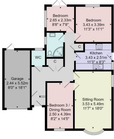
Total Area: 95.4 m² ... 1027 ft² All measurements are approximate and for display purposes only. No liability is accepted by either the agency or Box Property Solutions Ltd as to the exact measurements of the rooms. Box Property Solutions Ltd retains the copyright on this plan and allows agents to use it with agreed permission, Copyright 2017 Ac2