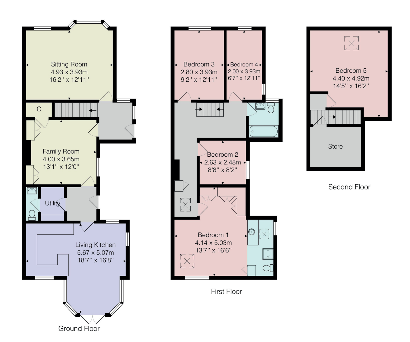
Total Area: 174.0 m<sup>2</sup> ... 1873 ft<sup>2</sup>

All measurements are approximate and for display purposes only. No liability is accepted by either the agency or Box Property Solutions Ltd as to the exact measurements of the rooms. Box Property Solutions Ltd retains the copyright on this plan and allows agents to use it with agreed permission.