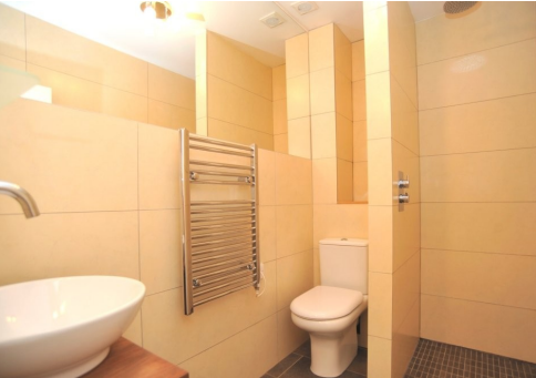
Flat 2, 1 Heywood Road, Harrogate, North Yorkshire, HG2 0LU