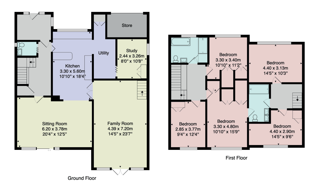
Total Area: 215.7 m² ... 2322 ft² All measurements are approximate and for display purposes only. No liability is accepted by either the agency or Box Property Solutions Ltd as to the exact measurements of the rooms. Box Property Solutions Ltd retains the copyright on this plan and allows agents to use it with agreed permission.