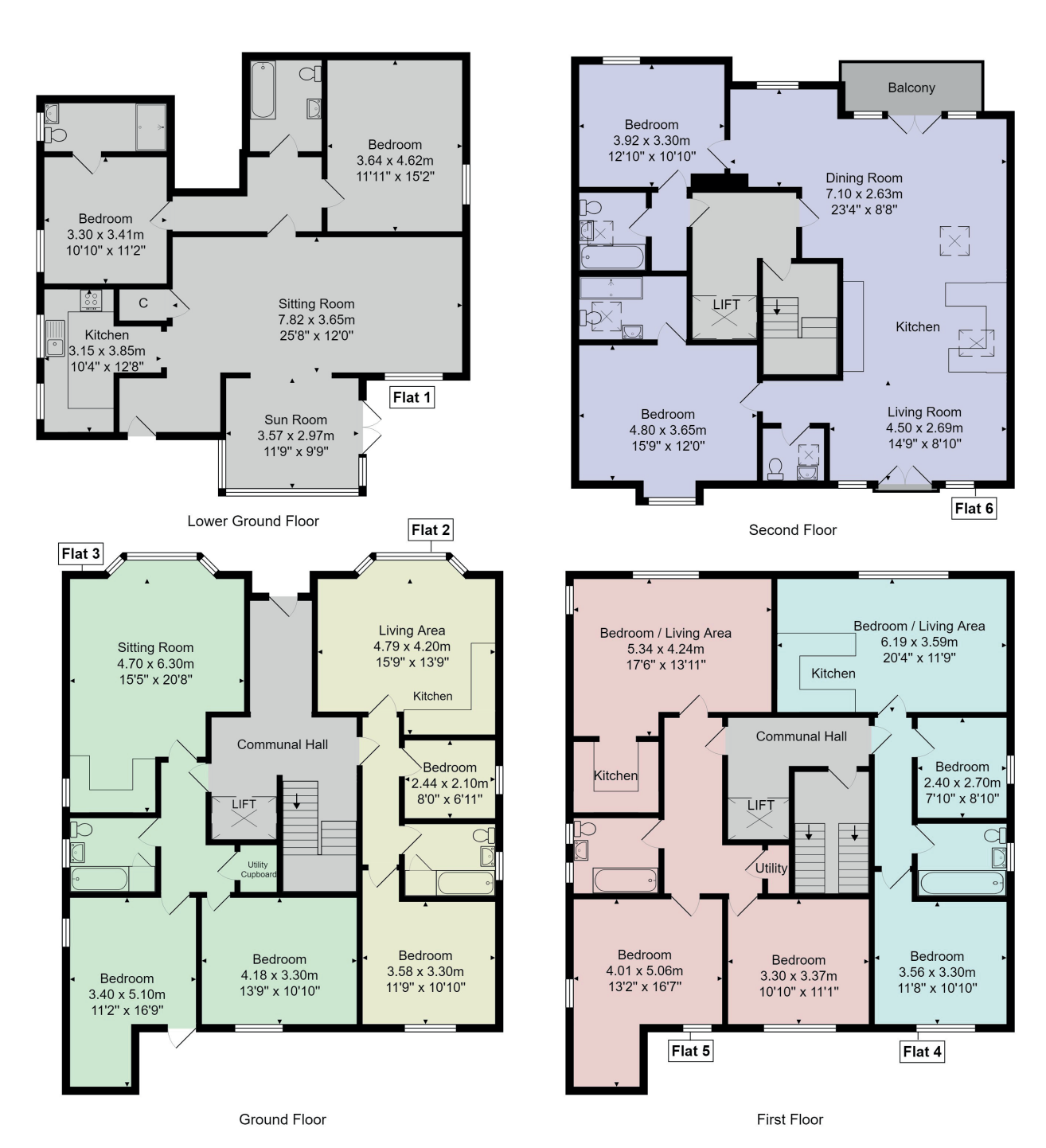
Total Area: 509.1 m² ... 5480 ft² (excluding balcony) All measurements are approximate and for display purposes only. No liability is accepted by either the agency or Box Property Solutions Ltd as to the exact measurements of the rooms. Box Property Solutions Ltd retains the copyright on this plan and allows agents to use it with agreed permission.