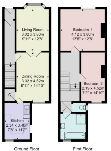
Total Area: 87.6 m? ... 943 ft? All measurements are approximate and for display purposes only. No liability is accept by either the agency or Box Property Solutions Ltd as to the exact measurements of the rooms. Box Property Solutions Ltd retains the copyright on this plan and allows agents to use it with agreed permission.